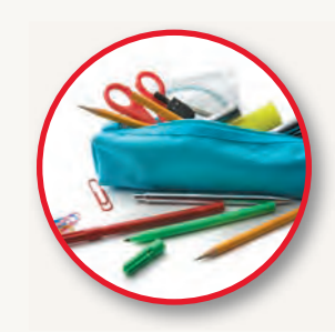
Back-to-school events with haircuts and school supplies.