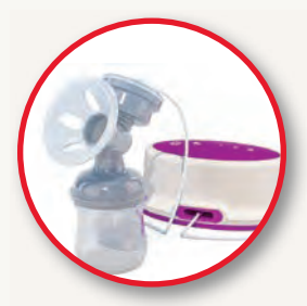
Electric breast pumps for new and expectant moms, with a prescription from your OB/GYN or midwife.*