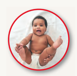
Diaper Days for children ages 0–30 months.