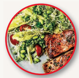
Home-delivered meals for new moms enrolled in Bright Start®.*