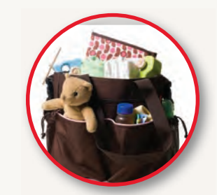
Regional baby showers with car seats, diaper bags, and more for qualifying members.